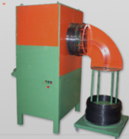
Wire Drawing Line Mechanic GTCE-2